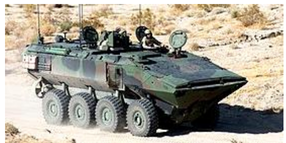
Marine Corps latest Amphibious Combat Vehicle (ACV)

Modern Day Marine is the largest military equipment, systems, services and technology exposition exclusively targeted to Marines and the Corps. The show floor hosts more than 300 exhibitors displaying the latest warfighting innovations and technology, briefings from influential Marines and DoD personnel, the OBJ1 Wargaming Convention , and more.