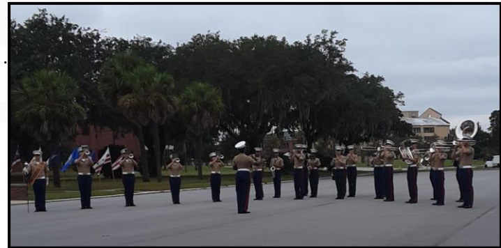
MCRD Band * Graduation Day * Friday 13 October